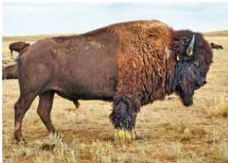
COLD CREEK BIG JOHN