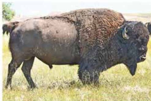
COLD CREEK GLADIATOR