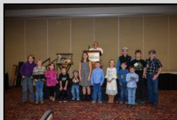
The Fun Auction Team!!