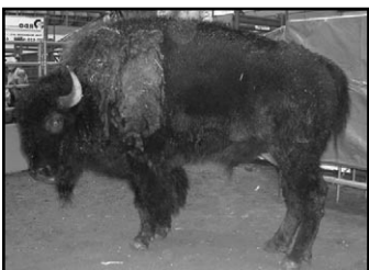
Grand Champion Bull